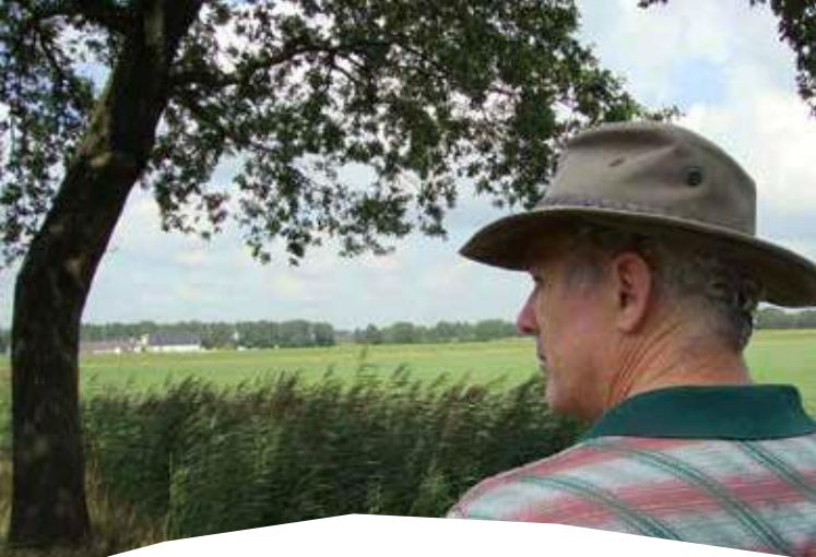
The Peel today