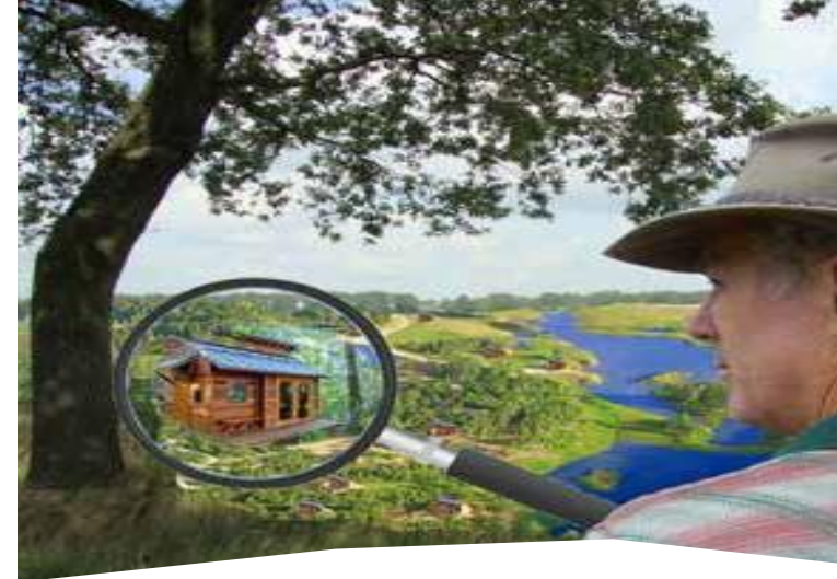
The Peel in 2030

The Peel with its rich history and illustrious past will revive to a benefit for the whole region